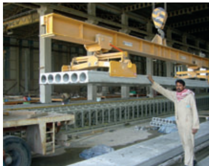
Quality hollow core produced in Mina Abdulla Ind City in Kuwait at High Slant Precast