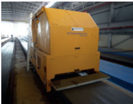
Xtramix Extruder in UAE producing pre-stressed concrete hollow core slabs

For more than 30 years Nordimpianti has been active in the supply of turnkey plants for the production of a wide range of pre-stressed concrete elements, such as T Beams, hollow core slabs, vineyard posts, lintels and more. Located in the middle of Italy, not too far from the capital Rome, they have delivered plants all over the world from Brazil to Korea to Saudi Arabia. It is a dynamic company which embraces change and has invested heavily in research and development making its plants more efficient and cost effective for its customers. It operates with constant investment in innovation, quality, safety of the products and after sales services in more than 30 countries all over the world.