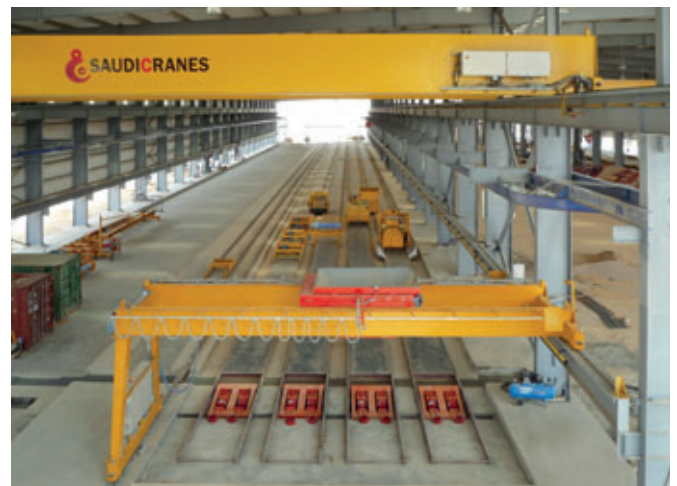
El Seif Precast – Phase one in al Kharj, KSA