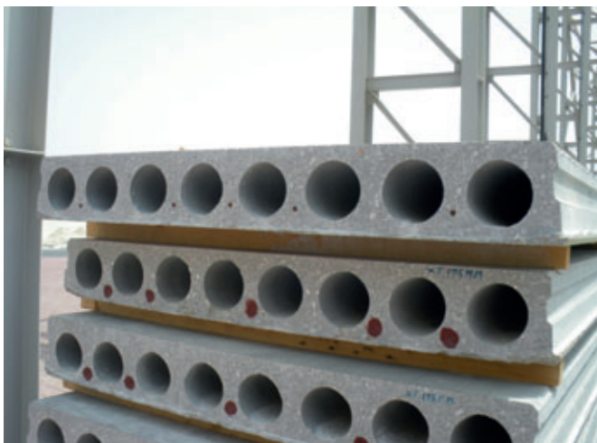
Quality hollow core slabs produced by Xtramix in Abu Dhabi, UAE

have increased further on the ability to have regional service and also spare parts available out of the station in Dubai.