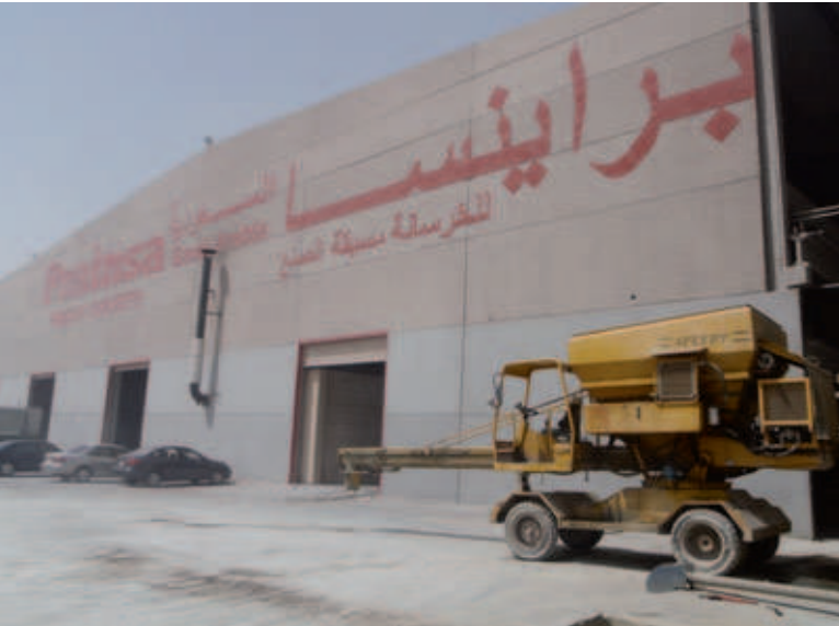
Bianchi Casseforme's Speedy

Prainsa Precast Concrete is a major manufacturer of hollow core and precast concrete elements with a particular focus on skyscrapers, commercial buildings, distribution centres, shopping malls and Bridge construction. Today, Prainsa is synonymous with an array of quality services which encompasses technical planning, civil engineering, manufacturing of precast concrete elements together with its transportation, as well as roof assembly and finishing touches to the building. Prainsa also manufacture concrete railway sleepers as part of its contribution to railway infrastructure.