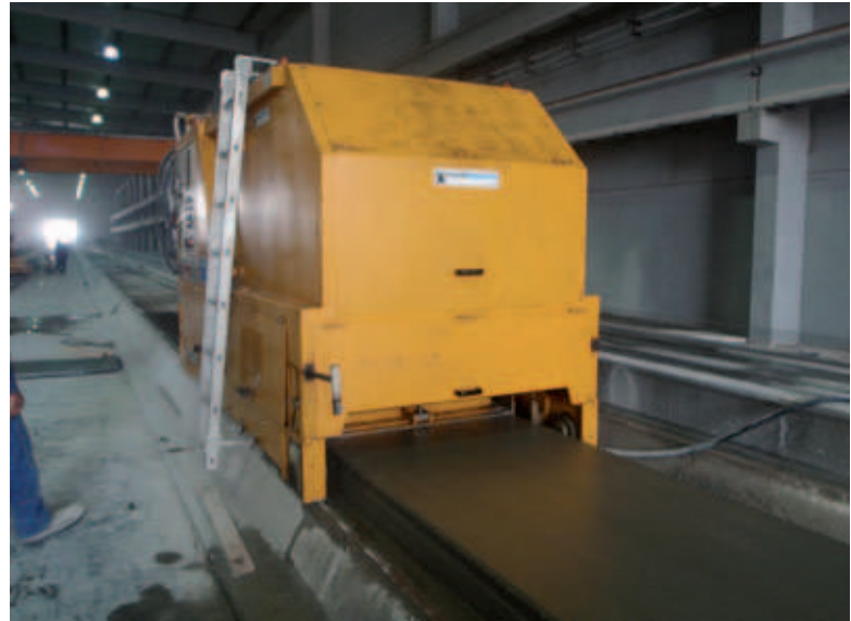
Nordimpianti System's Extruder in action

Founded in 1973 in Zaragoza, Spain, Prainsa has unwaveringly harnessed the latest technology to offer clients customized services and/or complete solutions while growing into a key player in the construction industry far beyond its European shores. In fact the Prainsa Group today owns a stable of 20 factories spread all over Spain, France, Chile, Argentina, Peru and the recently opened set-up in Dammam, Saudi Arabia.