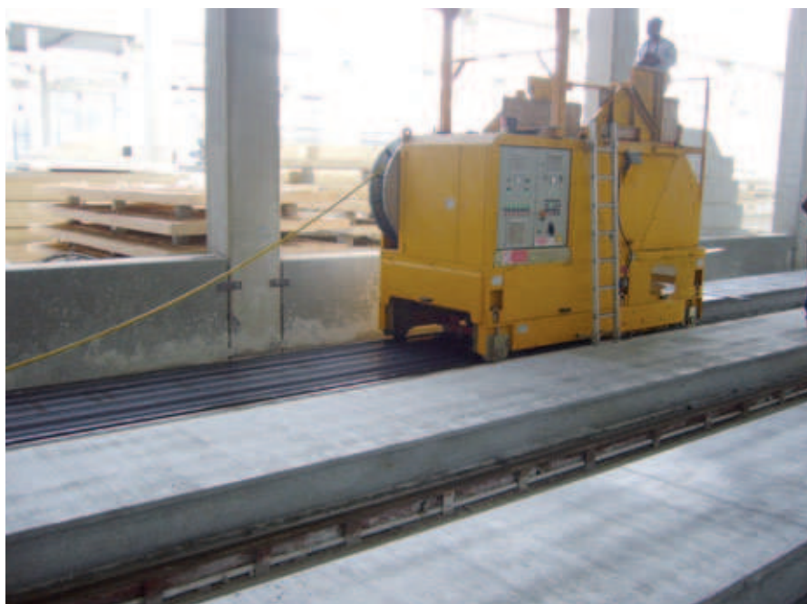
Extruder technology from Nordimpianti at High Slant Precast, Kuwait