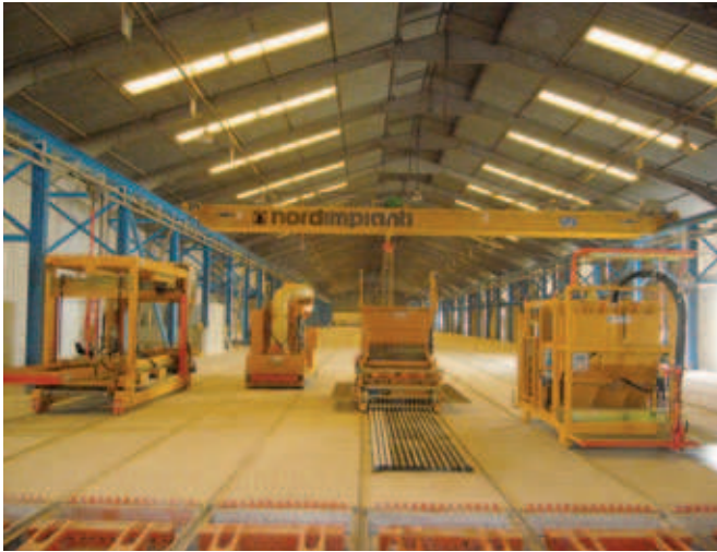
Slipform technology at from Nordimpianti at Locrete Industries, Kuwait

tated by mass production, but by also offering a fully personalized product that meets specific customers' requests. Nordimpianti products are highly sought after all over the world and this encourages the company to pump in constant funds in R&D, quality and safety standards while sustaining an excellent after-sales service.